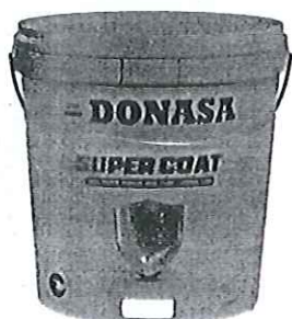
Sơn Super Coat - Sơn Nội thất Cao cấp