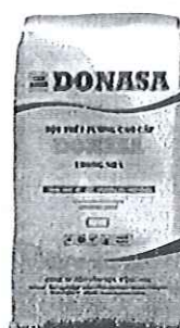
Bột trét Donasa