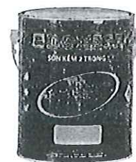
Sơn kem 2 trong 1