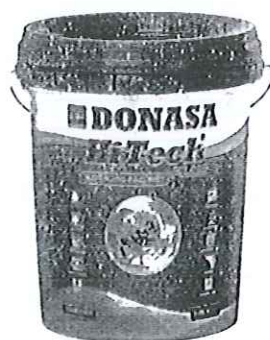
Sơn HiTech Plus - Sơn Ngoại thất Cao cấp