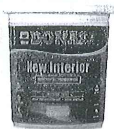
Sơn New Interior - Sơn Nội thất