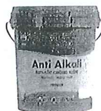
Sơn lót Anti - Sơn lót chống kiềm