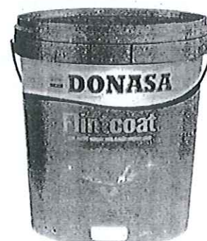
Sơn Flintcoat - Sơn ngoại thất Cao cấp