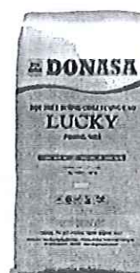
Bột trét Lucky