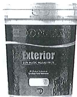
Sơn Exterior - Sơn Ngoại thất