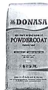
Bột trét Powdercoat