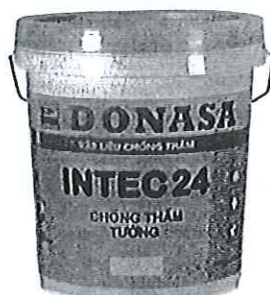
Chống Thấm INTEC 24_Tường/Sàn